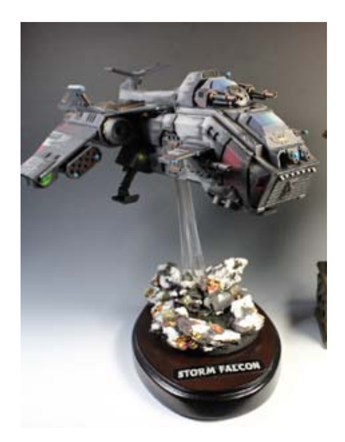
I personally use a 3M Series 6000 respirator with the 3M 6001 filters.

Another accessory you might want to consider is a moisture trap. Having one or two of these traps will prevent you from having water and moisture mixing with the air from the compressor. There are two types of traps. One that is placed near the compressor and one that can be attached to the gun. Both work fine, and even better in a combination.